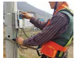
WORK BELT On a Telephone pole