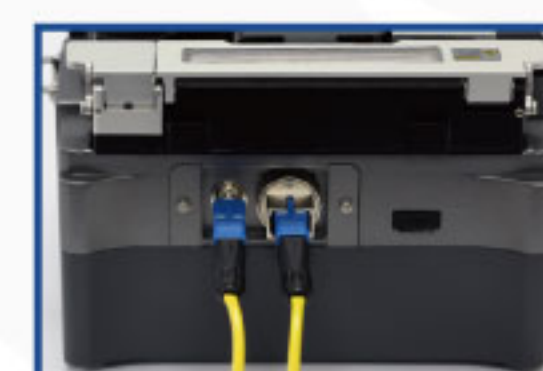
Power Meter & Fault Locator